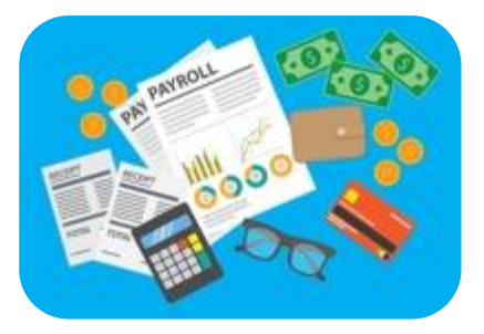
Payroll and Compensation Administration