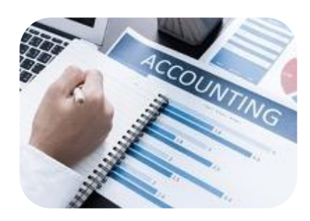
Accounting and Related Business Services